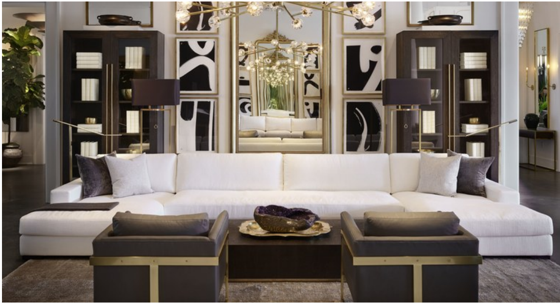
The gallery's RH Modern section.