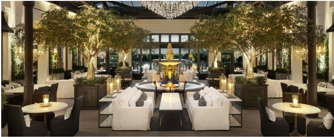
The rooftop restaurant.